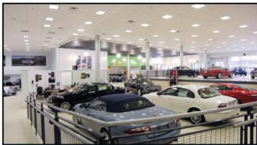
Four levels of the Infill Showroom allow for display of four individual brands while maintaining Reedman's auto mall feel.

Reedman-Toll Auto World added four automobile showrooms to their already expansive interior display. The 19,300 square foot Infill Showroom is home to Mazda, Jaguar and Subaru and connects two previously separated showroom spaces into one continuous flow of automobile inventory.