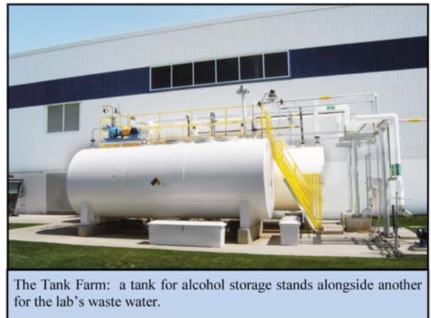
The Tank Farm: a tank for alcohol storage stands alongside another for the lab's waste water.